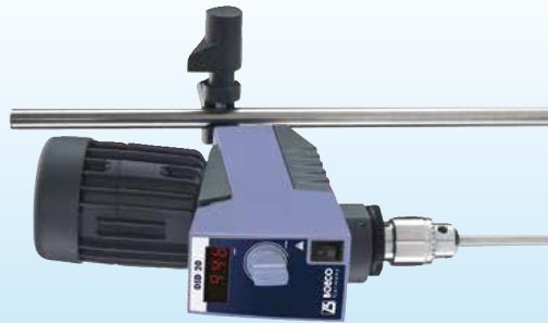
BOECO OVERHEAD STIRRER OSD-20

The OSD-20 conforms to the CE mark and all relevant EC standards and DIN norms and has been manufactured under ISO 9001:2000